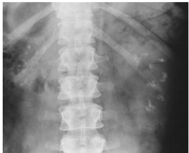
Fig. 2. Plain abdominal radiograph showing extensive nephrocalcinosis in a medullary distribution, with a small right kidney in the brother.